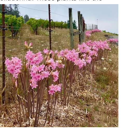
Naked Lady Lilies lining the driveway

I would like to believe that the unique weather and Goldridge soil are what make this site such an incredible place for grapes and might also make it a great