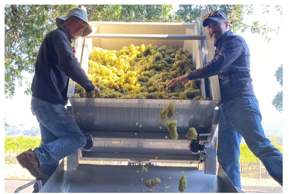
This year's first grapes were the Estate Viognier on September 22, 2023. Three weeks behind last year!

Sonoma Reds - Lot 18 (Sonoma Valley) 2018 CABERNET SAUVIGNON, RANDOM RIDGE VINEYARD (MT. VEEDER, NAPA VALLEY) 2017 Port (Sonoma Valley)